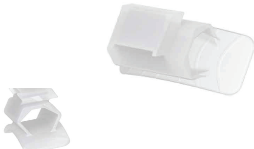
Adjustable forehead pad