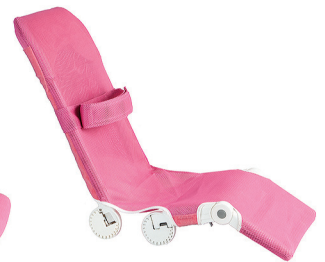
With calf rest (Z267)