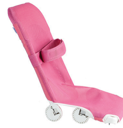
Without calf rest (Z269)