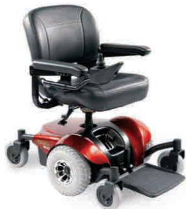
Pronto® M41™ with Fold-Down Seat

The Invacare® Pronto® M41™ power wheelchair is the latest offering in the sleek and versatile Pronto® series of power wheelchairs. The M41™ features the latest technology in electronics and in-line motors. This combination provides increased efficiency and battery range, as well as an increased top speed. The M41 also features a center-wheel drive platform, simplified SureStep®, and six wheels on the ground providing stability and maneuverability similar to other Pronto® models. All of these features are packed into a simple, clean-looking, and easy-to-service compact frame that provides mobility with style for people on the go!