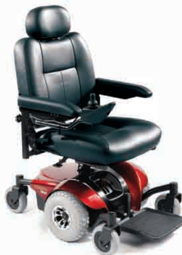
Pronto® M41™ with Semi-Recline Office-Style Seat