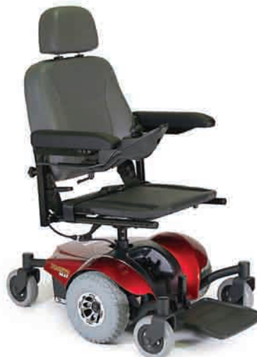
Pronto® M41™ with Solid Seat Pan.