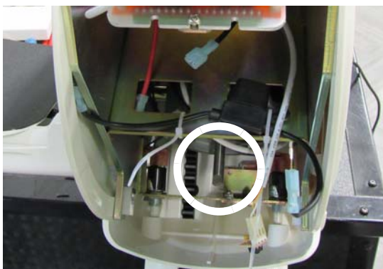
Batteries not installed in this view