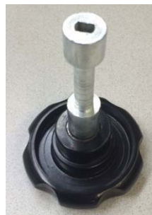
Manual operation tool