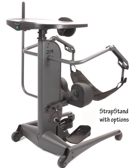
StrapStand with options