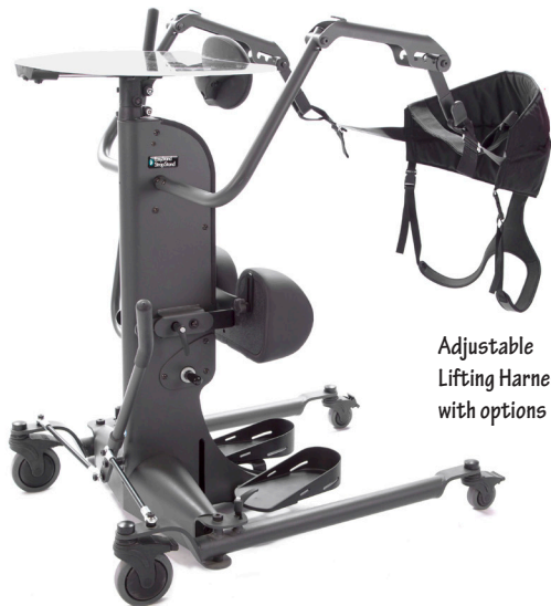
Adjustable Lifting Harness with options

The StrapStand's adjustability is well suited for multi-user environments. With popular options like swing-out legs, multi-adjustable foot plates, various sizes and styles of lifting straps, and independent knee pads, a facility can accommodate users of different sizes and diagnoses.