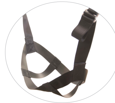
Adjustable Sling Strap