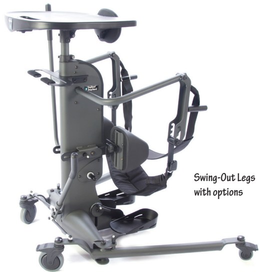
Swing-Out Legs with options