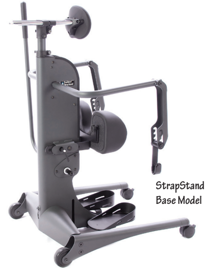
StrapStand Base Model

The StrapStand gives people the option to stand without transferring. Often, users are incapable of self-transfers or patient lifting is a concern for staff. In these cases, standing is possible directly from a wheelchair, bed, or other seated surface. In addition, we have adjustable lifting straps that work well for wheelchairs without removable arms and allow access to the tightest wheelchair seating.