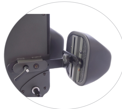
Independent Knee Pads