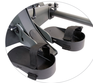
Multi-adjustable Foot Plates

The StrapStand's adjustability is well suited for multi-user environments. With popular options like swing-out legs, multi-adjustable foot plates, various sizes and styles of lifting straps, and independent knee pads, a facility can accommodate users of different sizes and diagnoses.