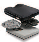
J3™ E2622, E2623 E2624, E2625