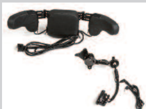
Switch-It Head Array