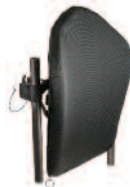
J3™ Posterior E2613