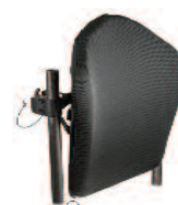
J3™ Posterior & Lateral E2615