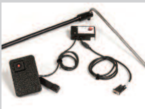
ASL Micro Joystick