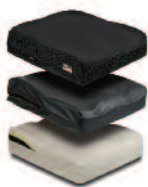
Union™ E2307, E2608