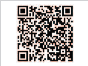
Specialty Controls Videos