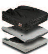
J2™/J2 DC E2622, E2623, E2624, E2625