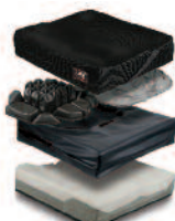
Fusion™ E2622, E2623