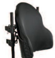
J3™ Posterior & Deep Lateral/Contour E2620