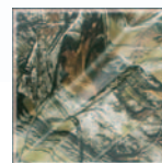
REALTREE AP CAMO