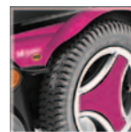
POP STAR PINK