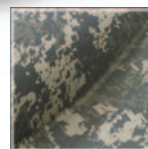
DIGITAL ARMY CAMO