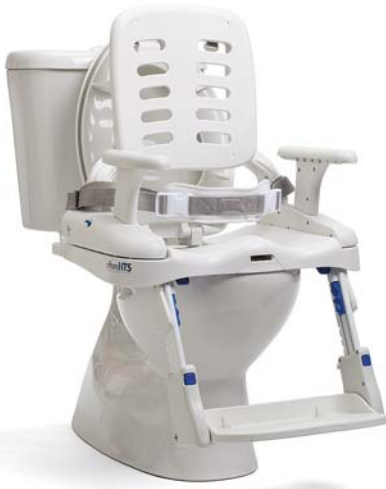
A basic medium HTS with seat, back, seat belt and armrests