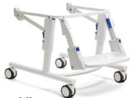
Mobile (non-tilt with footboard)