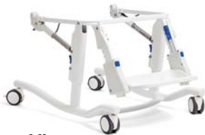
Mobile (tilt-in-space with footboard)