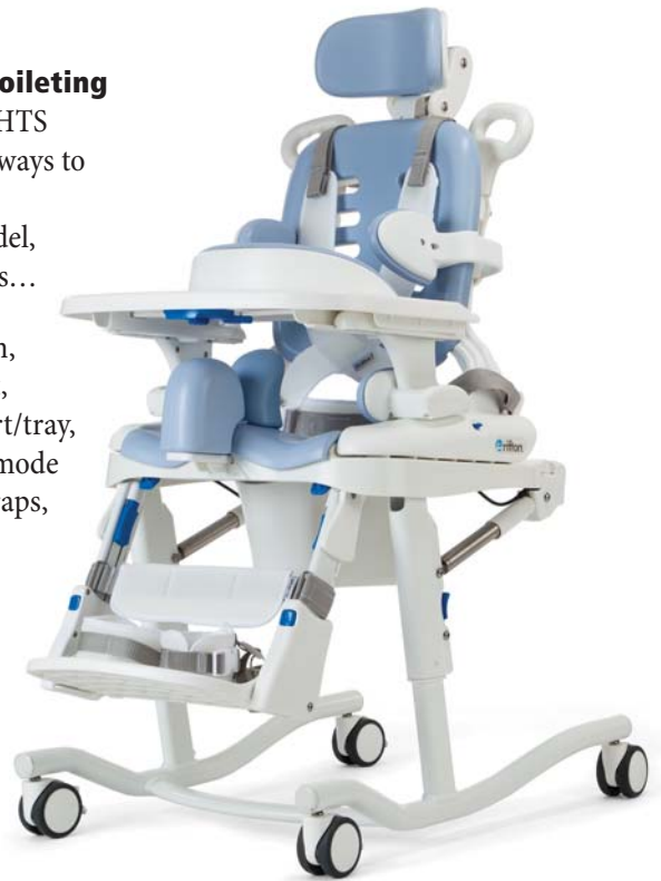
A fully accessorized medium HTS

...to the fully accessorized version, with seat and back pads, headrest, butterfly harness, anterior support/tray, lateral supports, hip guides, commode pan, deflector, abductor, ankle straps, calf rest and footboard.