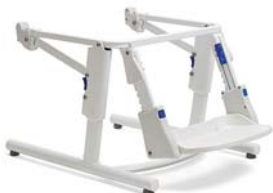
Stationary (non-tilt with footboard)