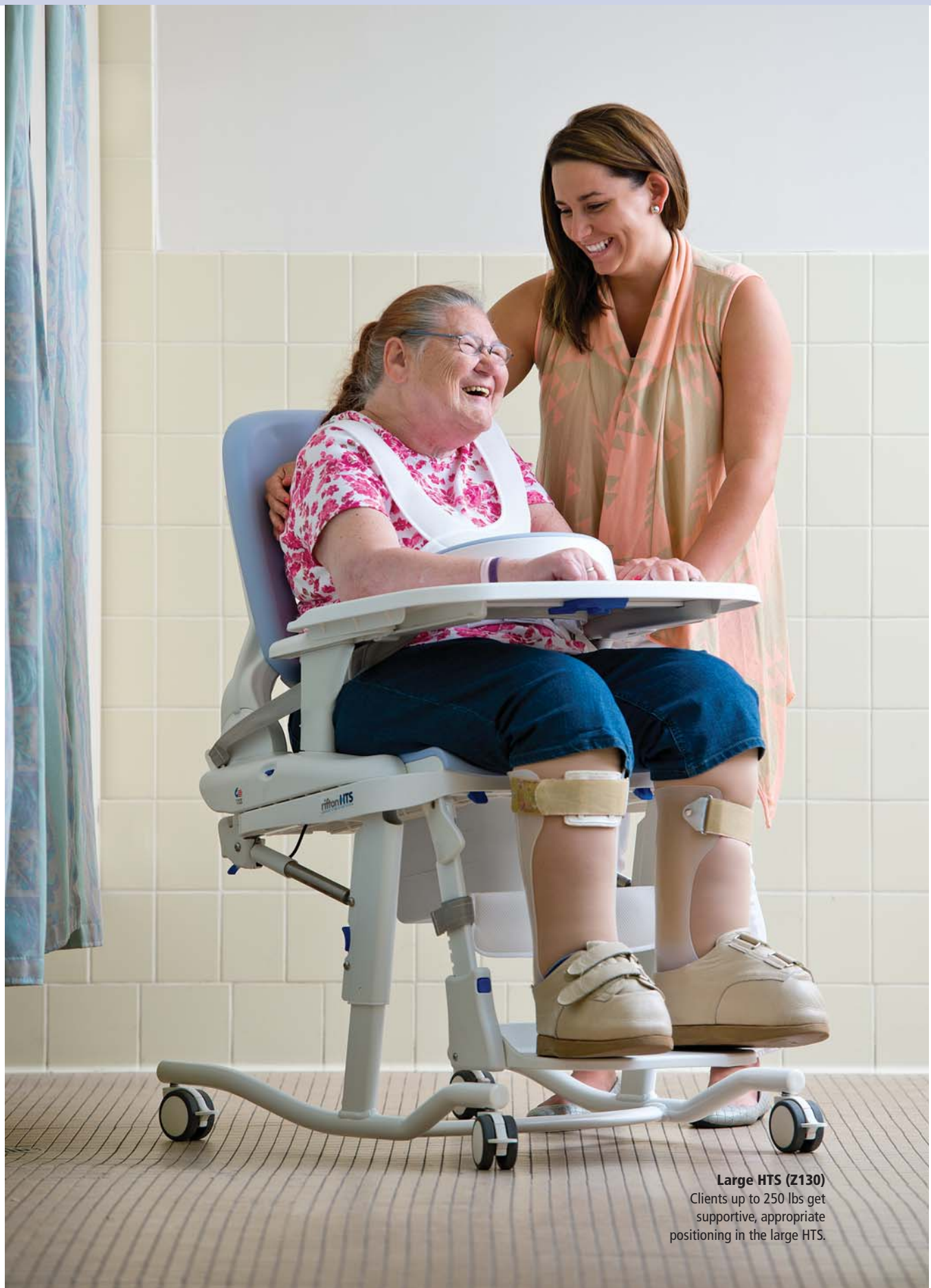
Large HTS (Z130) Clients up to 250 lbs get supportive, appropriate positioning in the large HTS.