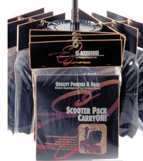
SPINNER DISPLAY RACK (stocked with 27 EZ-ACCESSORIES)

customerservice@ezaccess.com | 1.800.451.1903 | www.ezaccess.com