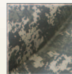
DIGITAL ARMY CAMO