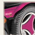
POP STAR PINK