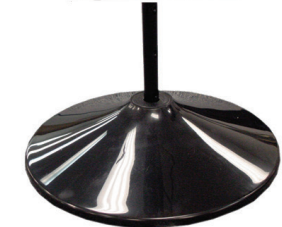
SPINNER DISPLAY RACK (stocked with 27 EZ-ACCESSORIES)