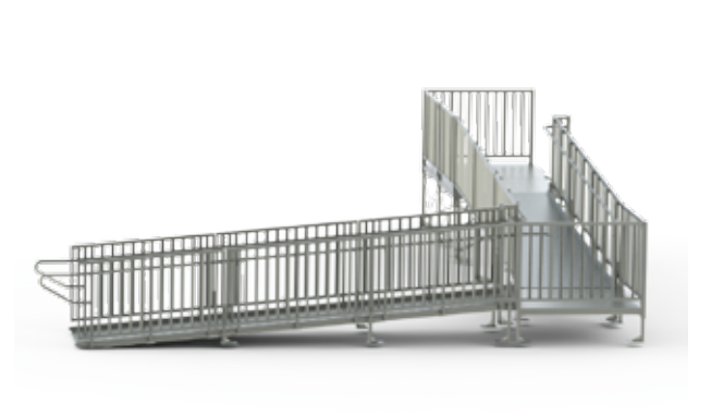
Ninety-degree turn with picketed guards and platform