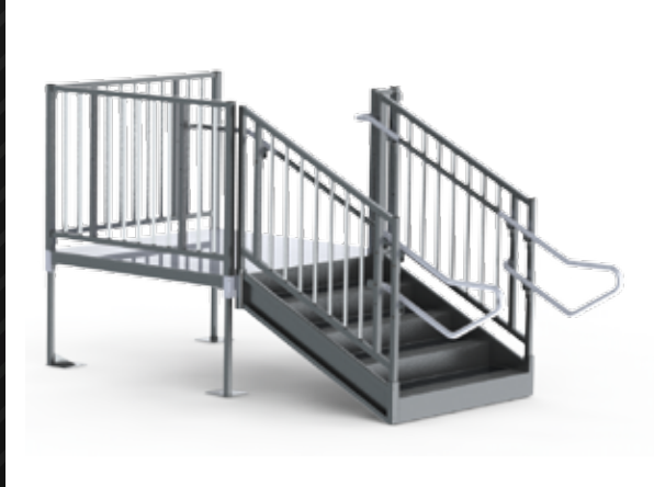
Titan step system with picketed guards