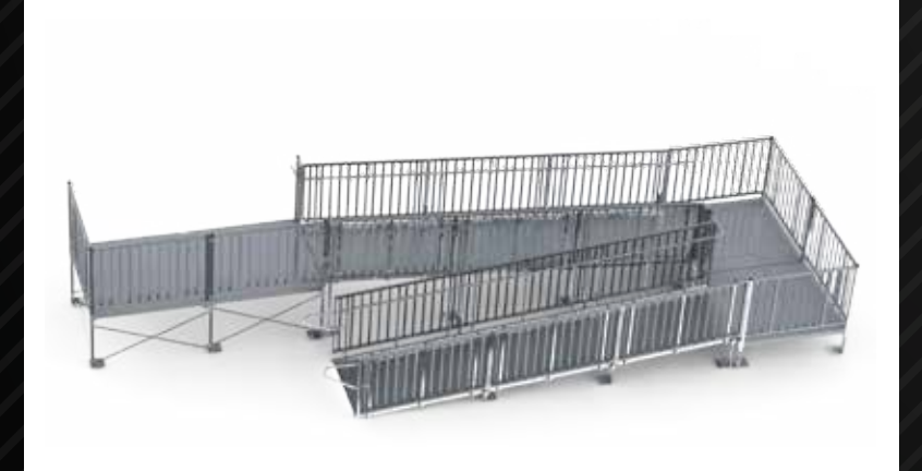
Turnback system with picketed guards and top platform