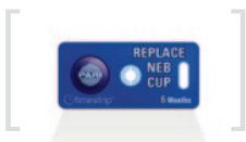
Timestrip® - 6 Month Reminder