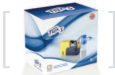
Trek® S Premium Packaging

All configurations include Wing Tip™ Tubing