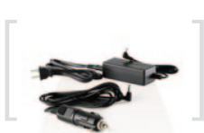
AC Adapter & 12V DC Adapter