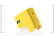
Li-Ion Rechargeable Battery Deluxe Only