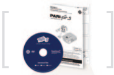
Trek® S Instructions & Instructional DVD