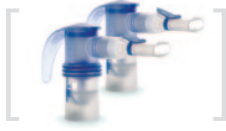
PARI LC® Sprint Reusable Nebulizer and backup reusable nebulizer