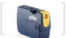
Trek® S Compressor

Trek® S vs. Other Portable Nebulizer Systems²