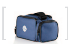
Deluxe Carrying Case