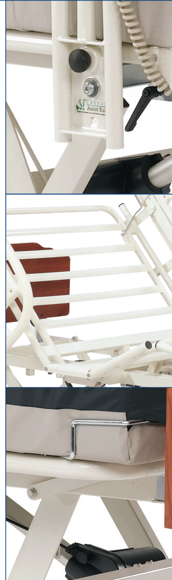
CS5 bed featured with Assist Rails, Kent Bed Ends and Invacare® Solace® Mattress

It's time to change your definition of value. The Carroll CS Series™ CS5™ Bed was developed for facilities requiring mobility at any height at a great value, and who appreciate the trademark Carroll CS Series Bed design elegance including the slat deck and tool-less assembly.