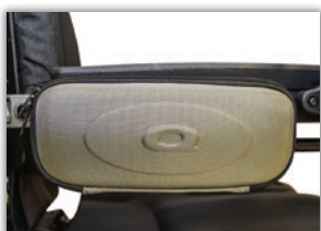
Glove Box MSRP: $125