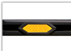
Reflector Kit MSRP: $50