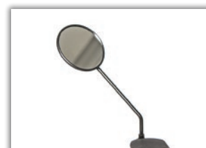
Rearview Mirror MSRP: $50