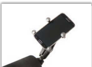
Phone Holder MSRP: $50