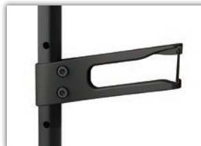
Backpack Holders (Pair) MSRP: $50