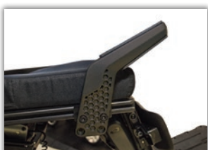
Transfer Bars (Pair) MSRP: $200