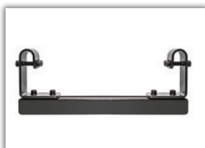
Rear Accessory Bar MSRP: $100