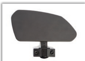
Clothing Guards (Pair) MSRP: $200