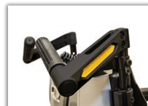
Push Handles (Pair) MSRP: $175