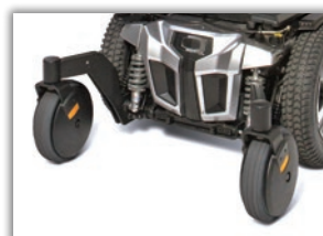
8" Caster Wheels (4) MSRP: $150