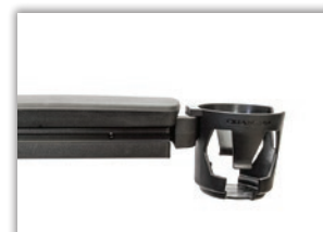
Cup Holder Complimentary with TRU-Balance® 3

Not all items shown are available on all products. Please contact your authorized Quantum® provider for details.