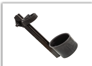
Oxygen Holder MSRP: $200