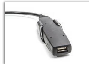
USB Mobile Device Charger MSRP: $175