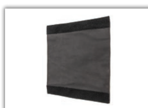
Privacy Flap (3 sizes) No charge on recline seating MSRP: $35