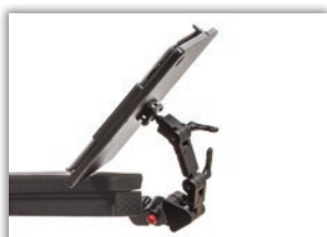
Tablet Holder MSRP: $375