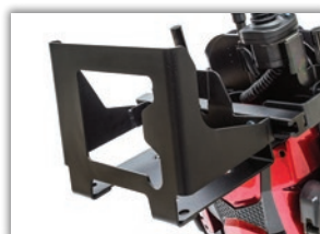
Trilogy Vent Tray MSRP: $400