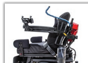
Hydration System MSRP: $200