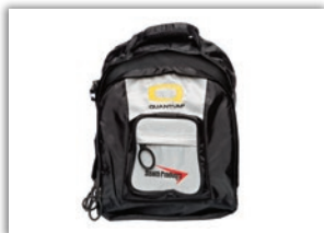
Quantum® Backpack MSRP: $75