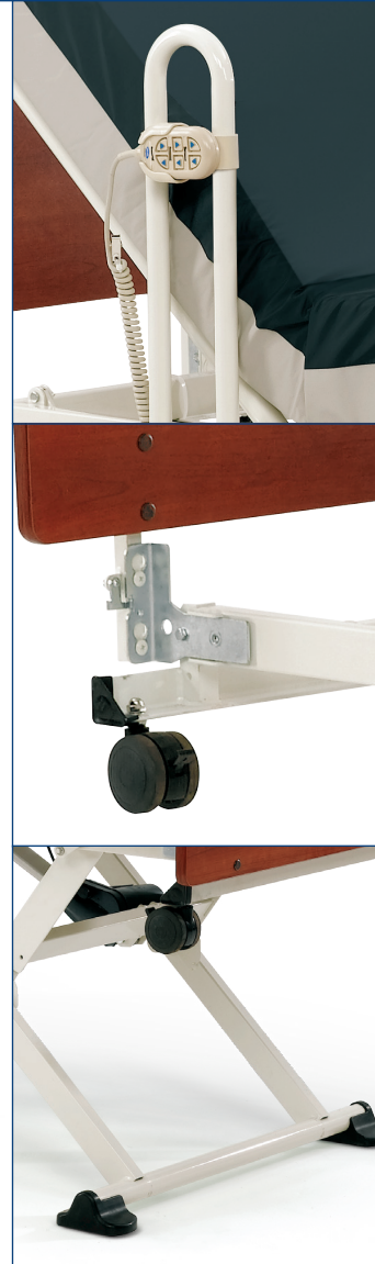
CS3 bed is featured with Assist Bar, Drake Bed Ends and Invacare® Solace® Mattress

The Carroll CS Series™ CS3™ Bed was developed with safety in mind for those who require a bed that is stable throughout the travel range and mobile in the lowest position only.